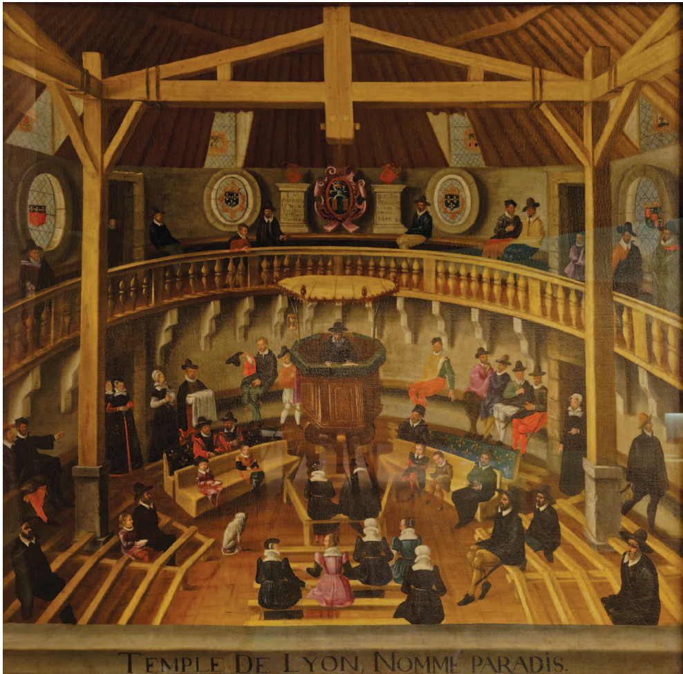
Jean Perrissin (1569–70), Le Temple de Paradis.

However, the centrality of the Bible would inevitably and in a very short amount of time result in rather different kinds of worship. This is a painting of a Calvinist service in France about 15 or 20 years after Luther's death.