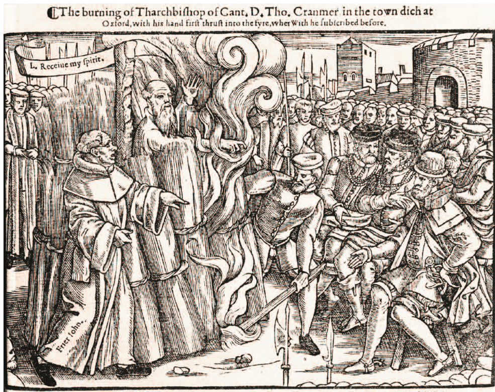
Execution of Archbishop Cranmer, woodcut from from Foxe's Book of Martyrs.