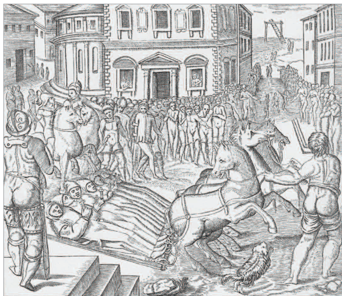
Execution of Carthusian monks at Tyburn, 1535. Artist: Nicolas Beatrizet (1904). They resisted the royal supremacy in England under Henry VIII and were brutally hung, drawn and quartered after being starved.