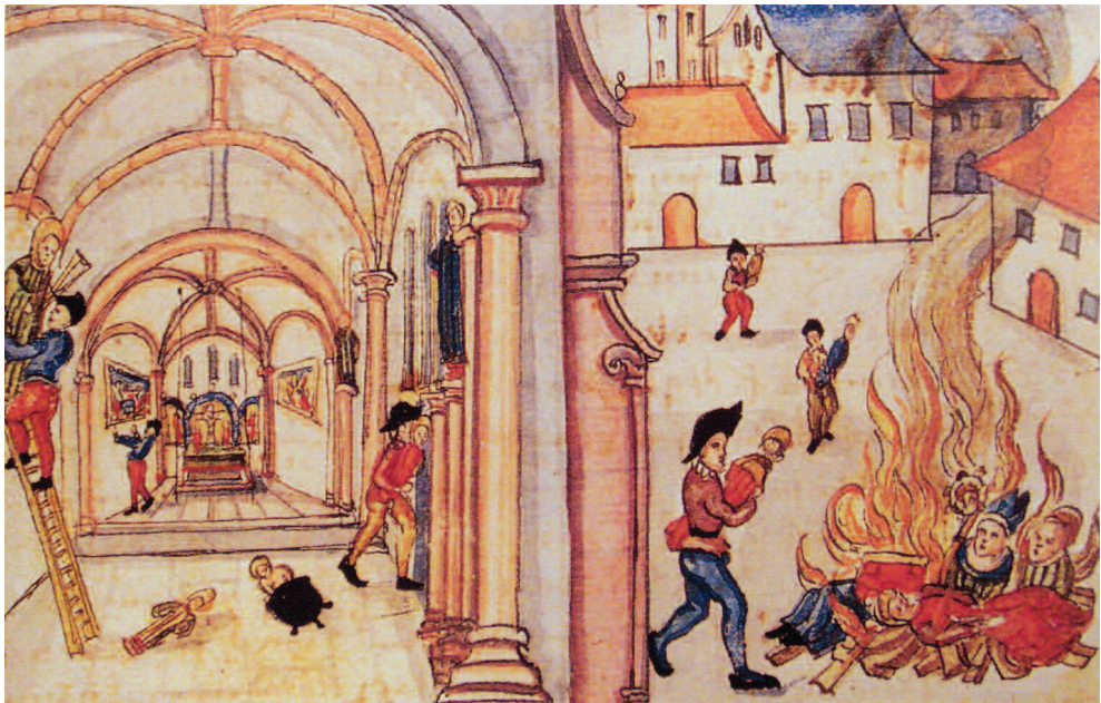
'Destruction of icons in Zurich 1524' (Anon.).

More's horror at the chaos that the Reformation had unleashed is explicable in terms of his own time. More than that, one of the consequences of the Reformation in the early 1520s was a great wave of iconoclasm.