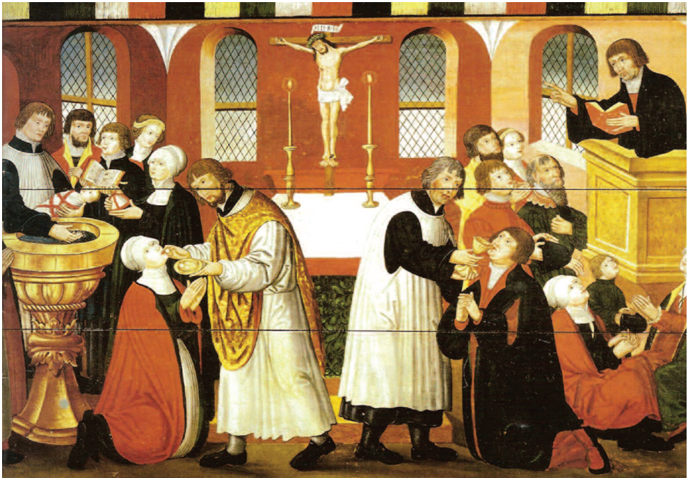
'Martin Luther preaching to the faithful' (1561, Church of Toroslunde).

It is certainly true that Luther introduced aspects of Christianity which all the churches of the West now recognise as central. Luther was, above everything else, of course, a Bible translator. Luther triggered a religious revolution which focused on the Word of God in the vernacular and thereby initiated a transformation of Christian worship. His own reordering of Christian worship was extremely conservative. He reduced the number of sacraments to three and then two: essentially Baptism with Eucharist, and confession/penance as an option. But he didn't, for example, abolish the traditional Mass vestments, he continued to recommend the use of a crucifix in church, and he even used Latin in the Mass.