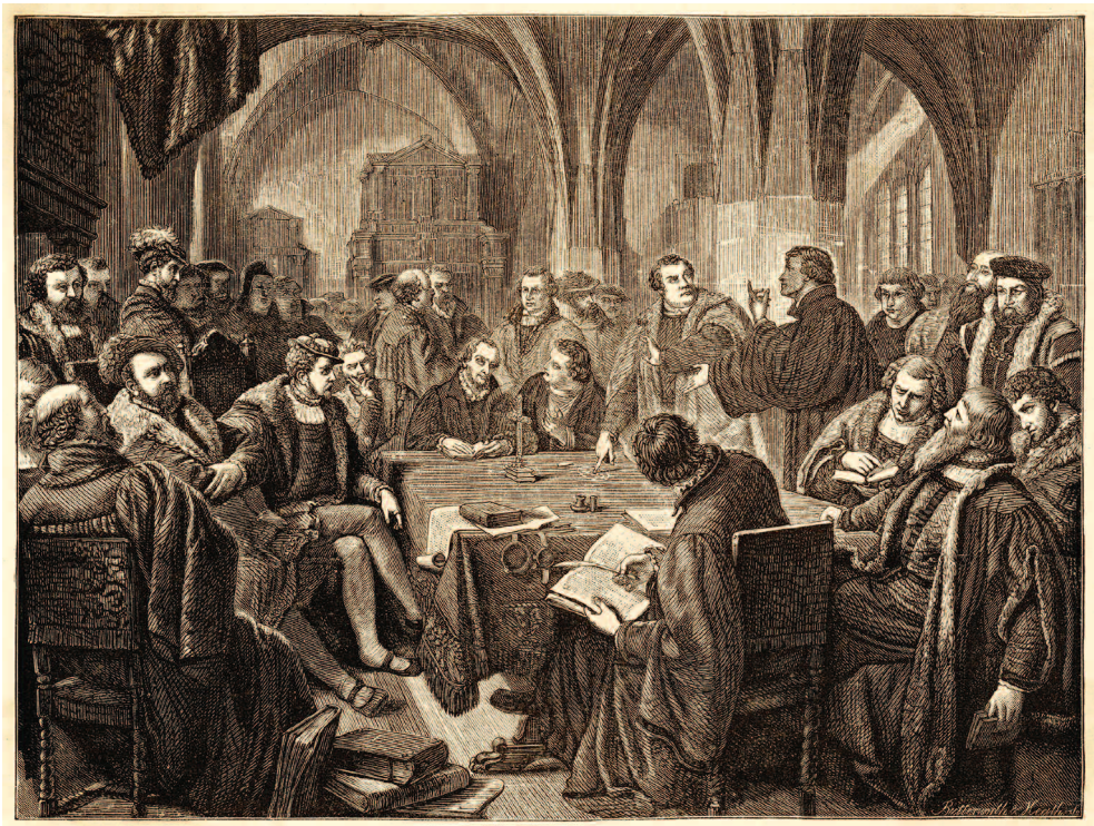
Marburg Colloquy, October 1529.

name Anabaptist. These, along with the other groups that subsequently emerged – Presbyterians, Congregationalists, Shakers, Quakers, Mennonites, Amish, Pentecostals and, yes, even Methodists – shared some beliefs and attitudes in common. They all prioritised the written word of God in the Bible over the traditional Church's teaching and discipline. They all vehemently rejected the papacy and the allegedly materialistic religious system which the papacy headed. But they were divided among themselves – often lethally divided – on almost everything else. Within a single generation of Luther's protest, Protestants were excommunicating, fighting and persecuting each other, as well as the common Catholic enemy, and many were calling for a reform of the Reformation. So what characterises the religious transformations of the sixteenth century and their outworkings in the centuries that followed is not a single unifying energy – good or bad, the Reformation – but rather variety and multiple incompatibilities.