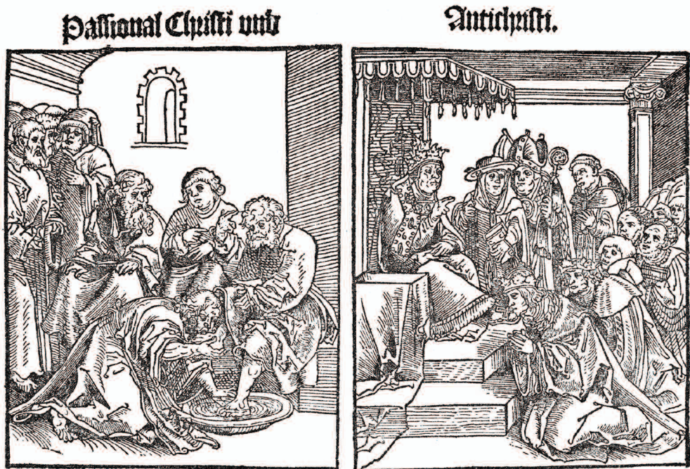
Anti-papal woodcut (c.1500).

At the heart of Luther's message was the affirmation of God's mercy, freely available to faith. That's an entirely positive message, but his message also had a very strong negative charge. When he encountered opposition from the ecclesiastical authorities, it involved very rapidly a denunciation of the traditional Church as no church at all. From the very early stages of Luther's protest, he harnessed print into this kind of negative comparison between Christ and the official Church. Here we have Christ washing his disciples' feet and the pope having his feet kissed.