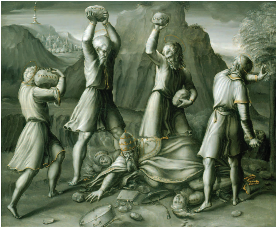
Girolamo da Treviso (active c. 1497–1544), A Protestant allegory (c. 1538–44).

Another print from the 1540s contrasts the worship of the true Church, rooted on Luther's preaching of Christ's merits, with monastic and papal preaching, coupled with the sale of indulgences and pleading the merits of the saints rather than of Christ. It's a very strong, clear negative message which demonises the Church at large, and centuries of the Church's past. Very quickly, then, Luther's Reformation takes the form of the disowning of huge tracts of the Christian past. It was implicit in Luther's declaration that if the Church found itself unable to accommodate his teaching of justification by faith alone, then that was too bad for the Church. It meant the Church was wrong. So we get this polarising, which is taken up all over the Reformation world. This is a picture which Henry VIII commissioned from an Italian painter Girolamo da Treviso, and it shows the four Evangelists stoning the pope to death.