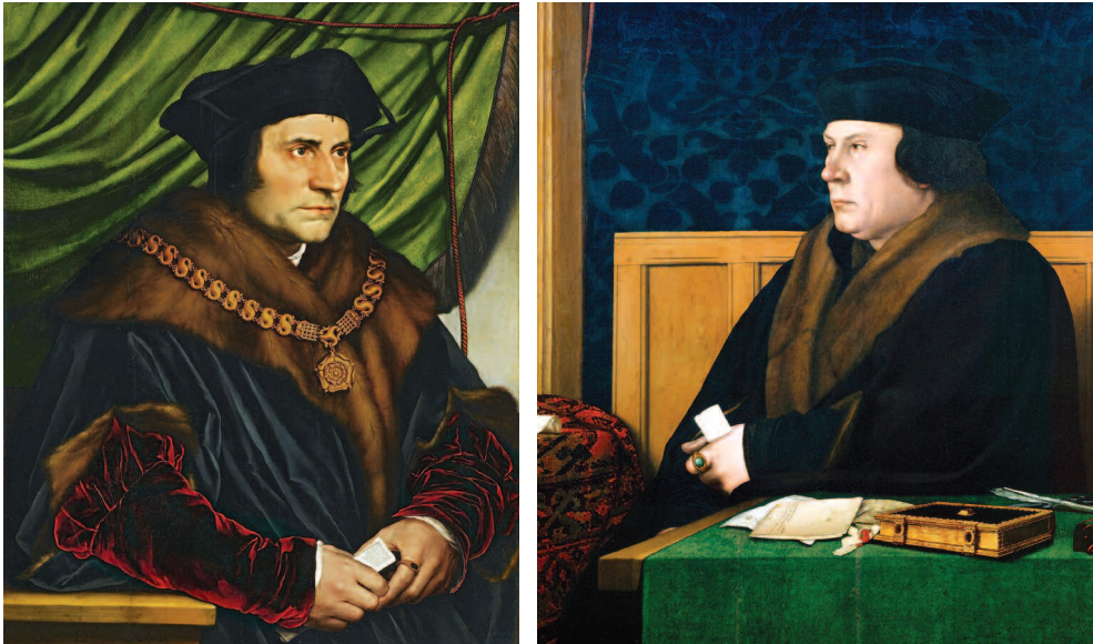
(left) Sir Thomas More, Hans Holbein (1527). (right) Thomas Cromwell, Hans Holbein (1532–33).

Now I want to go to the source of these Reformation changes in England in the 1520s to consider some of the nature of these conflicts. I want to reflect on the tragic dimension of the original split as it worked out in the lives of two great Tudor figures: Thomas More and William Tyndale.