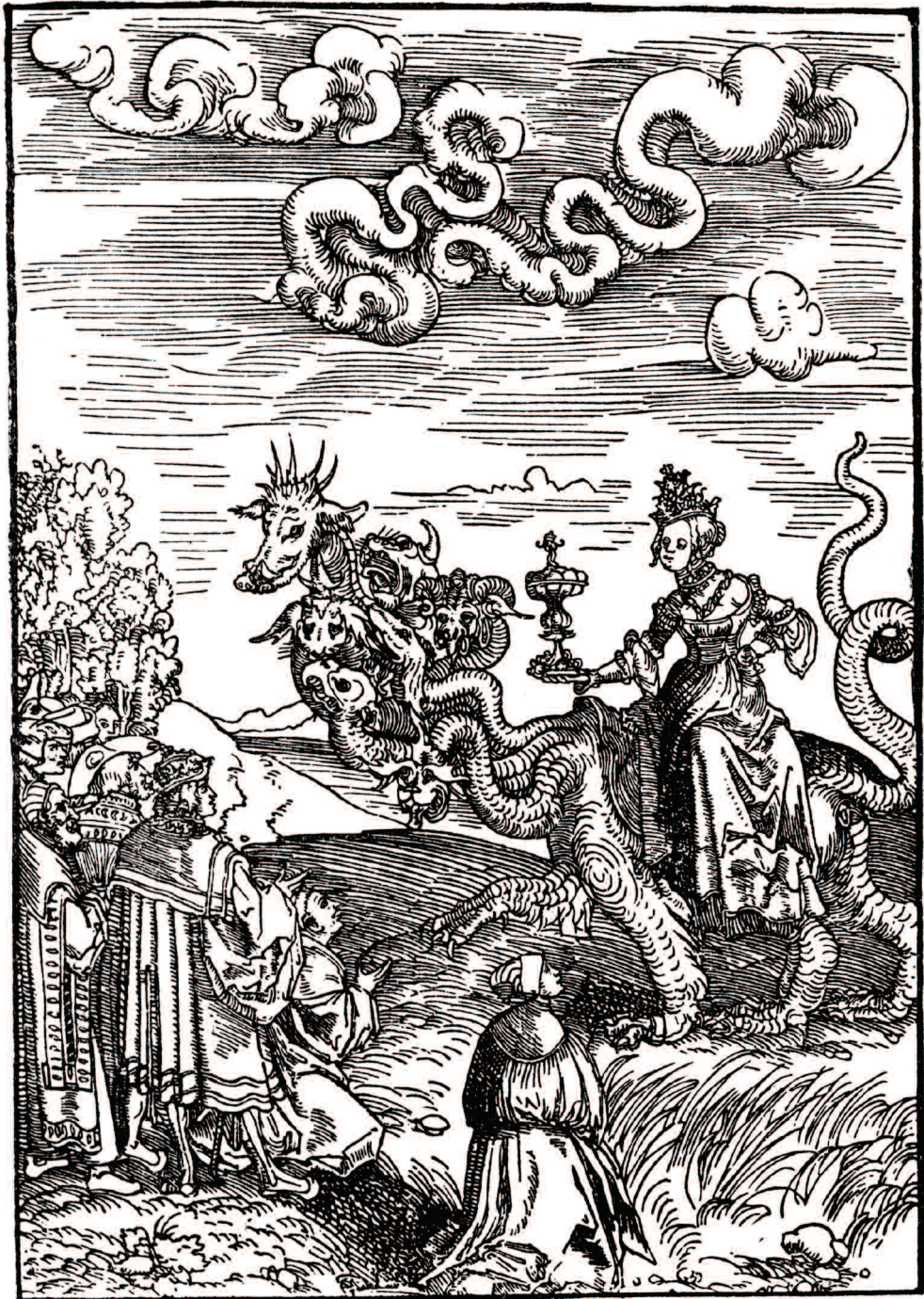
Whore of Babylon woodcut by Lucas Cranch the Elder (c. 1475–1553). from Luther's New Testament (1522).