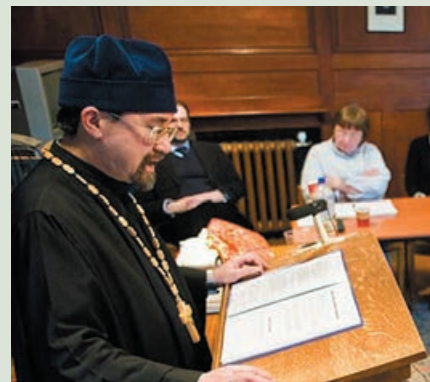
The Institute for Orthodox Christian Studies