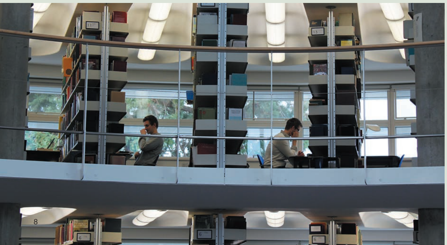
University of Cambridge Faculty of Divinity