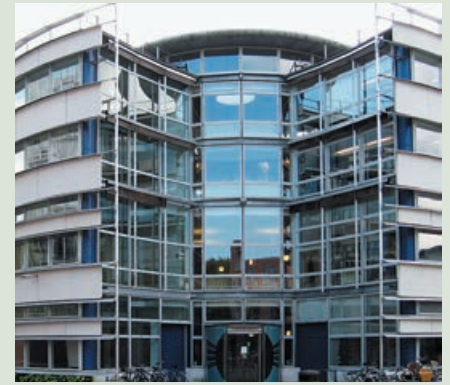
University of Cambridge Faculty of Divinity

The first Methodist meetings were held in Cambridge in 1800, Wesley himself having been prevented from entering the city by the Puritan authorities. Today there are two Methodist churches in walking distance of Wesley House which are part of the Cambridge Methodist Circuit. They minister amongst the great diversity of Christian presence in the city. All the major denominations are represented including Eastern Orthodox and Pentecostal churches and communities of Chinese, Korean and other language groups. There are also Muslim, Jewish and Buddhist communities in the city.